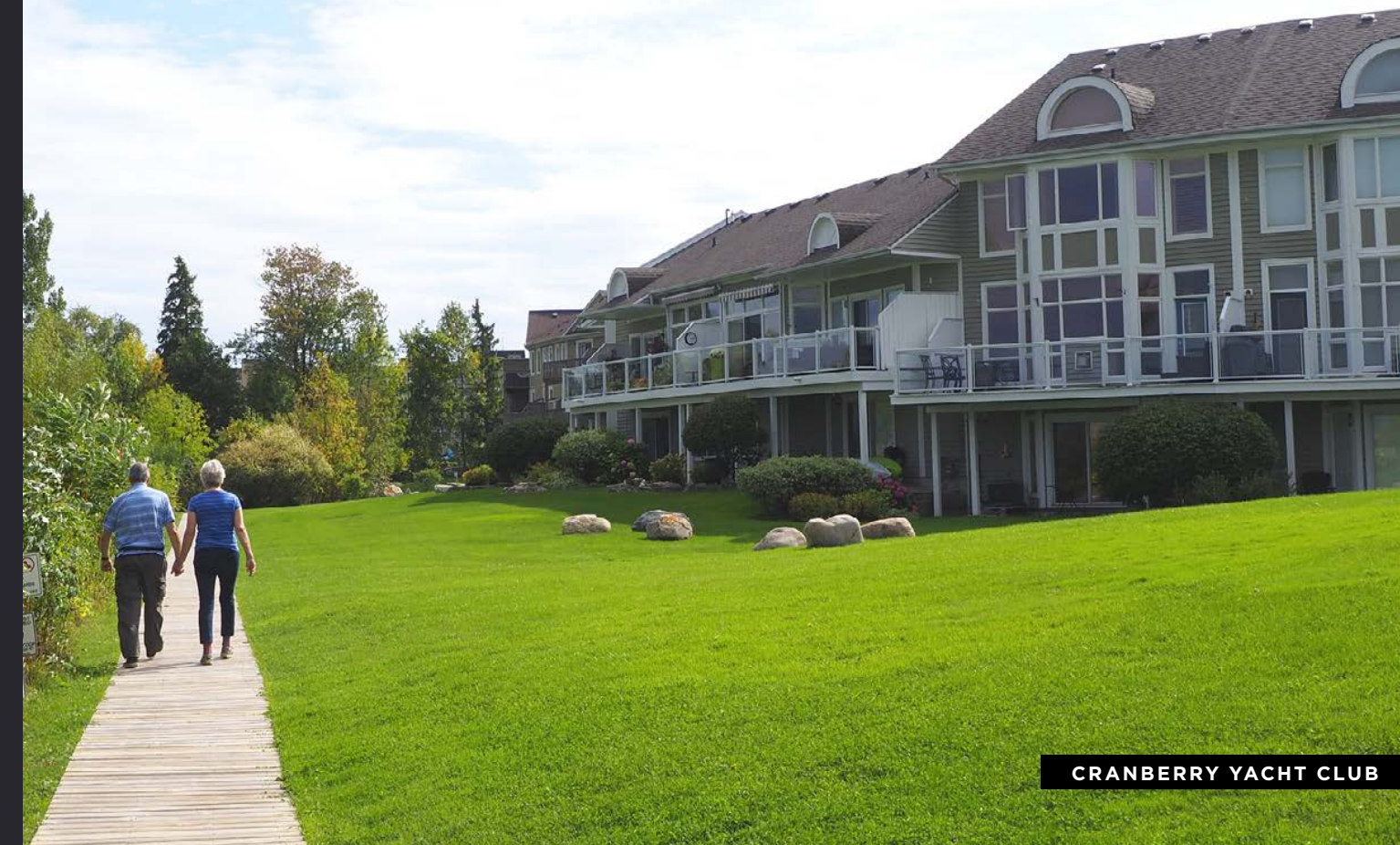
CRANBERRY YACHT CLUB